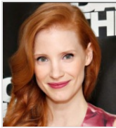
Jessica Chastain President