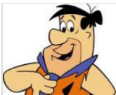
Fred Flinstone Sergeant-at-Arms